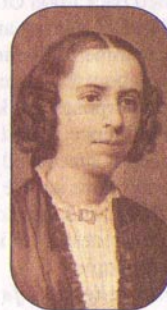
Catherine Booth (1829-1890) and her husband William founded The Salvation Army in 1865 in their home country, England. Together they raised eight dedicated Christian children and preached the Gospel worldwide.

Oh friends! Will you get this baptism of love! Then you will, like the apostles, be willing to stuff your body into a basket and be let down by the wall, if need be—or suffer shipwreck, hunger, peril, nakedness, fire, or sword, or even beheading (II Cor. 11:23-33)—if thereby you may enlarge His Kingdom and win souls for whom He shed His blood. Oh Lord, fill us with this love and baptize us with this fire! And then the Gospel will arise and become glorious in the earth, and men will believe in us, and in it. They will feel its power, and they will yield to it by the thousands, and by the grace of God, THEY SHALL!