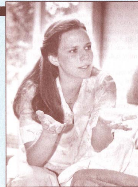
Word Of Faith World Outreach Center

A: Absolutely. I can tell you from my own experience, that baby is a full-fledged human at the very beginning.