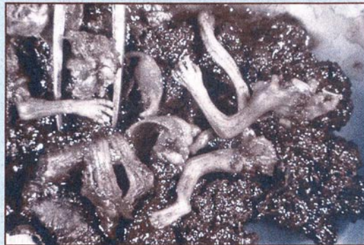
Hayes Publishing Co.

Right before I was born again, in August of 1979, we got a lady in that was 18 weeks along. We saved her until the very end of the day because she was so big. We knew she would bleed a lot and holler a lot—that it