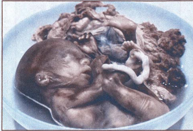
Hayes Publishing Co.